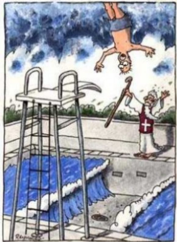
Moses' first and last day as a lifeguard.